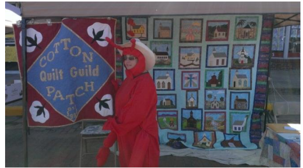
Raffle quilt at Chifferfest in Cooper on 10/19 was a hit with Mrs. Chigger. 214 tickets were sold.

Don't forget to turn in your raffle tickets!!! Sell, sell sell!!! We printed an additional 300 tickets. Let's see if we can beat last year's record!!